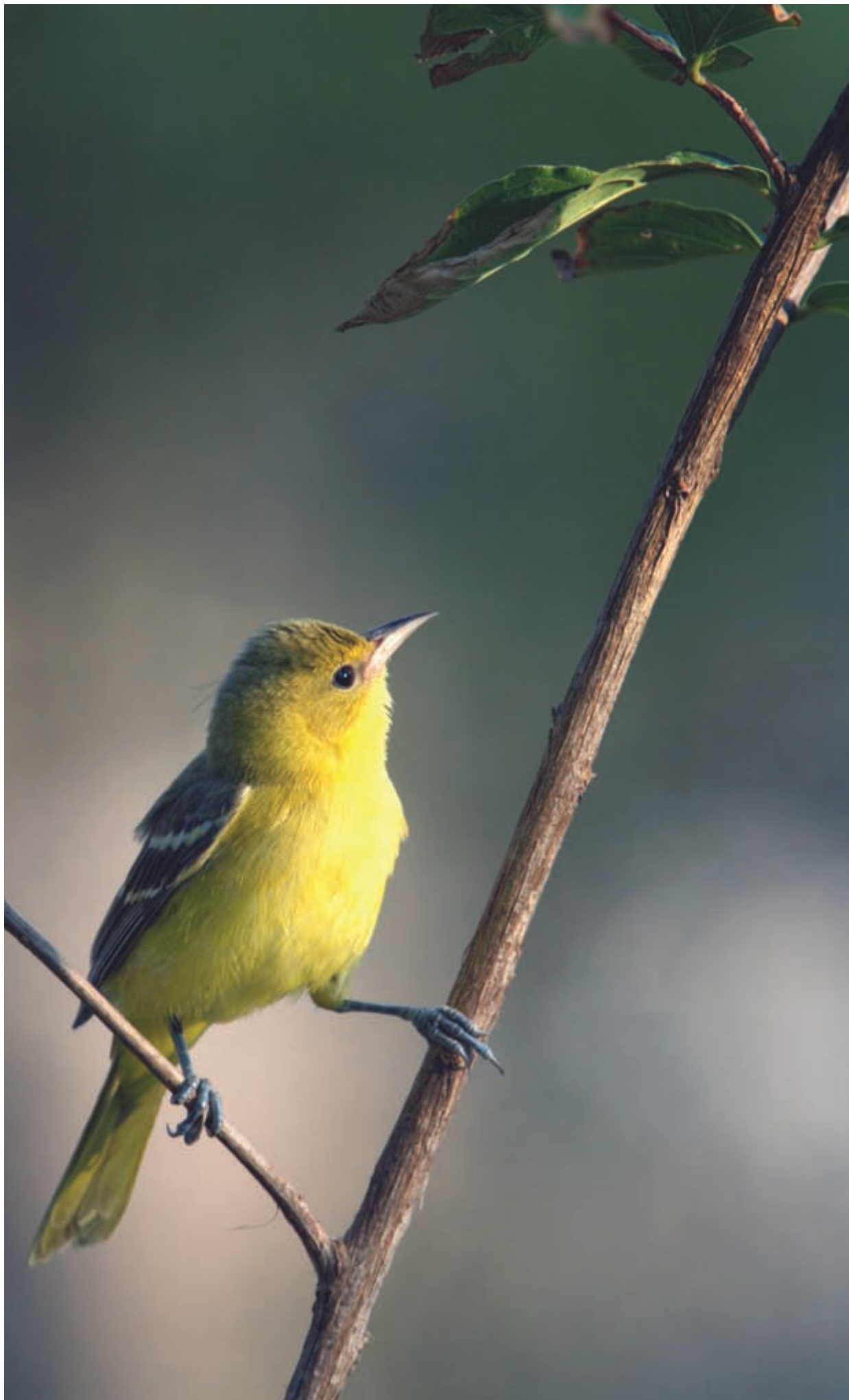
Howard Cheek's photo "Orchard Oriole" took the top prize in the Texas Parks & Wildlife magazine's 2011 photo contest in the plant/animal category.