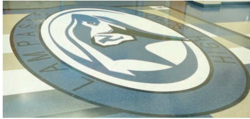
Badger territory A logo painted on the floor tiles will greet those entering the main door of Lampasas High School when school begins Monday.

A complete list of tax-free clothing and school supplies can be found at www.txtaxholiday.org .