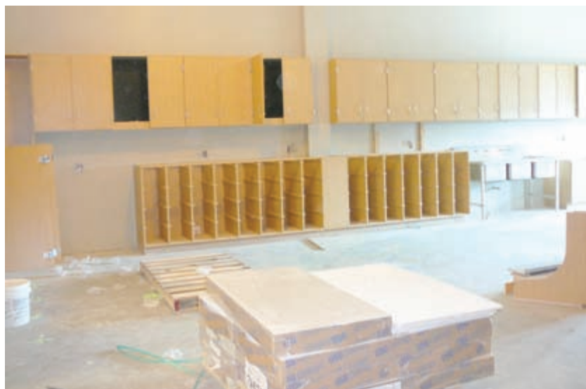
Art teacher Sylvia Berry's classroom contains ample storage.