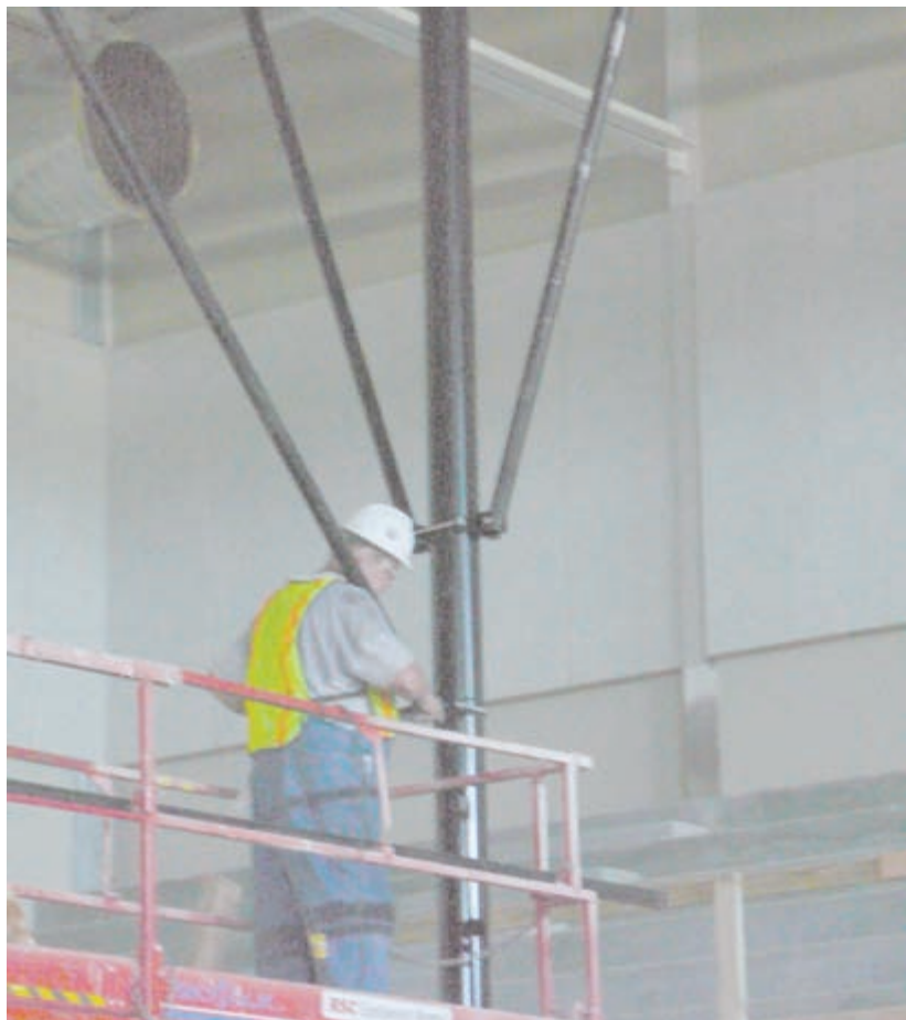
Basketball goals are being installed in the practice gym.