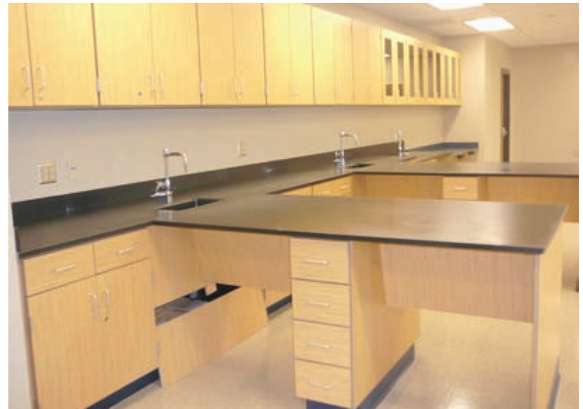
Classrooms feature modern cabinetry and other amenities.