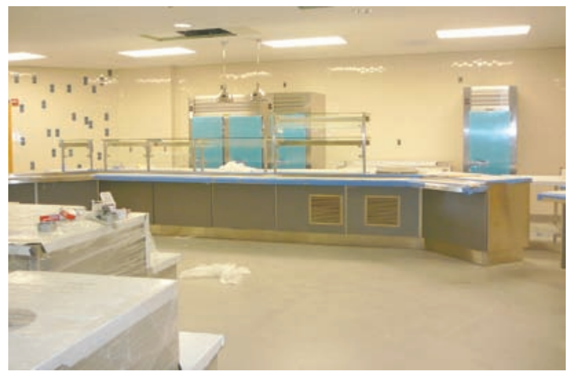
Most of the equipment is in place in the kitchen.