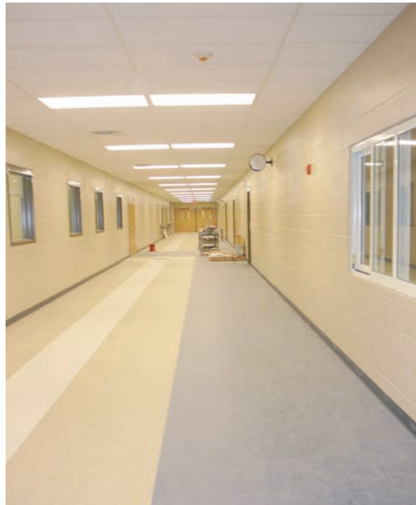
Hallways are wide enough to allow easy transfer between classes.