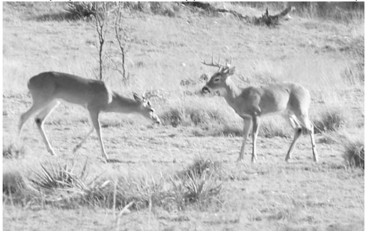
The 2008-09 general deer season is over, and these two young white-tailed bucks made it through unscathed, probably due to the antler restrictions in Lampasas County that specify bucks with only one unbranched antler or those with an inside spread of 13 inches are legal.