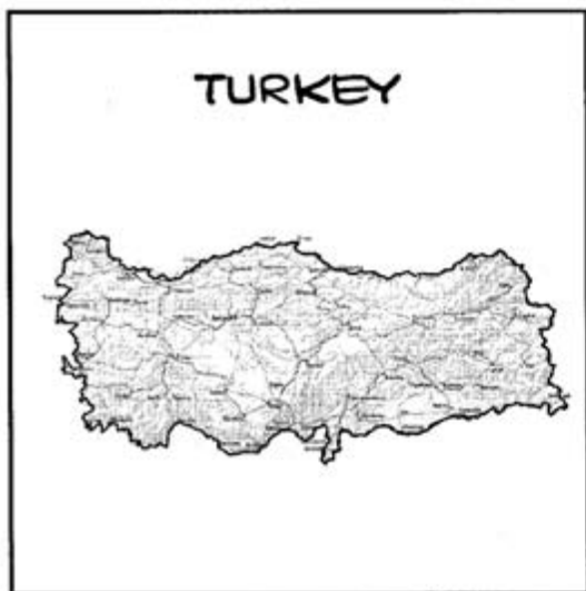
© 2007 CREATORS SYNDICATE INC. WWW.CREATORSSYNDICATE.COM CORRELL